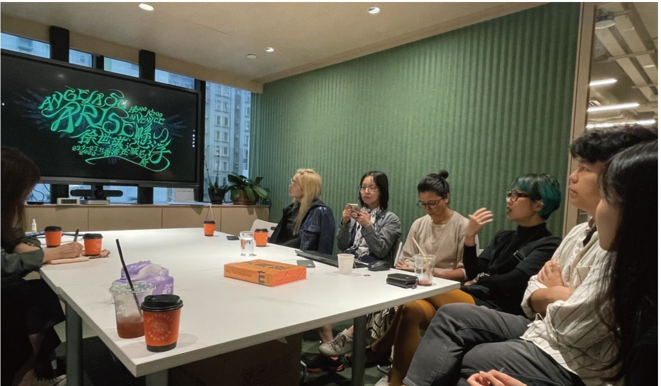
Meetings with Hong Kong artists at Asia Art Archive