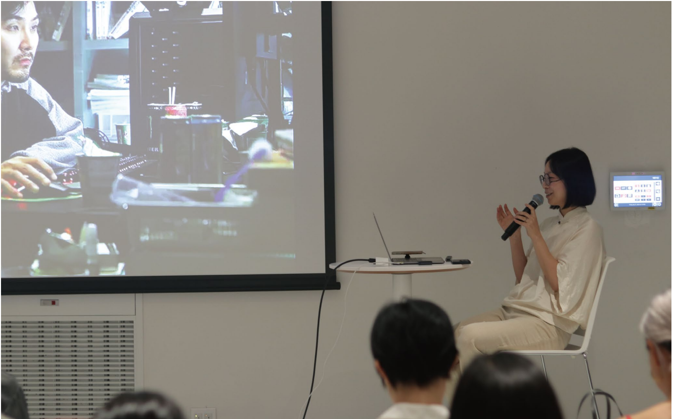
Gu Ling "Arbre" A Conversation about an Ordinary Art Shop"