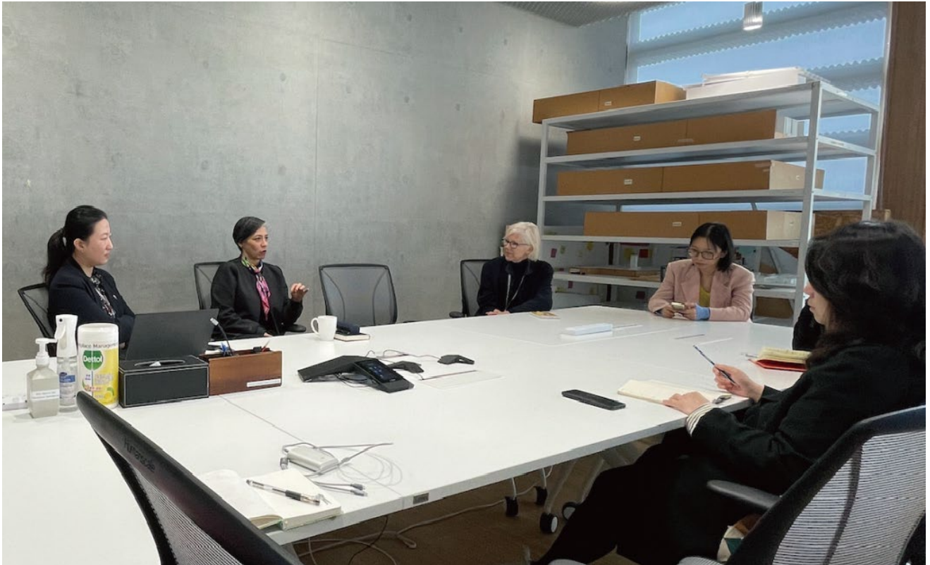
Learning from M+, Hong Kong